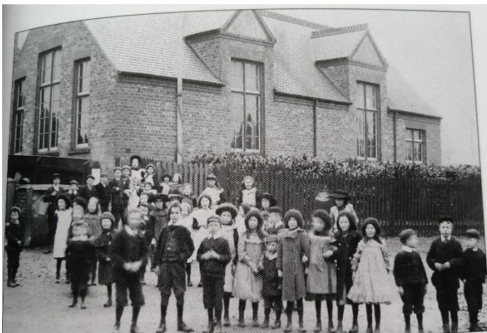
North Kelsey School back in 1910 now the Village Hall.

The newest School is Kelsey Primary on Chapel Street and was officially opened in 1988.