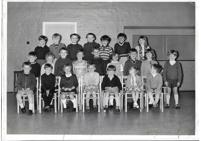
North Kelsey School back in 1975, photo taken in the Canteen, which has since been demolished.